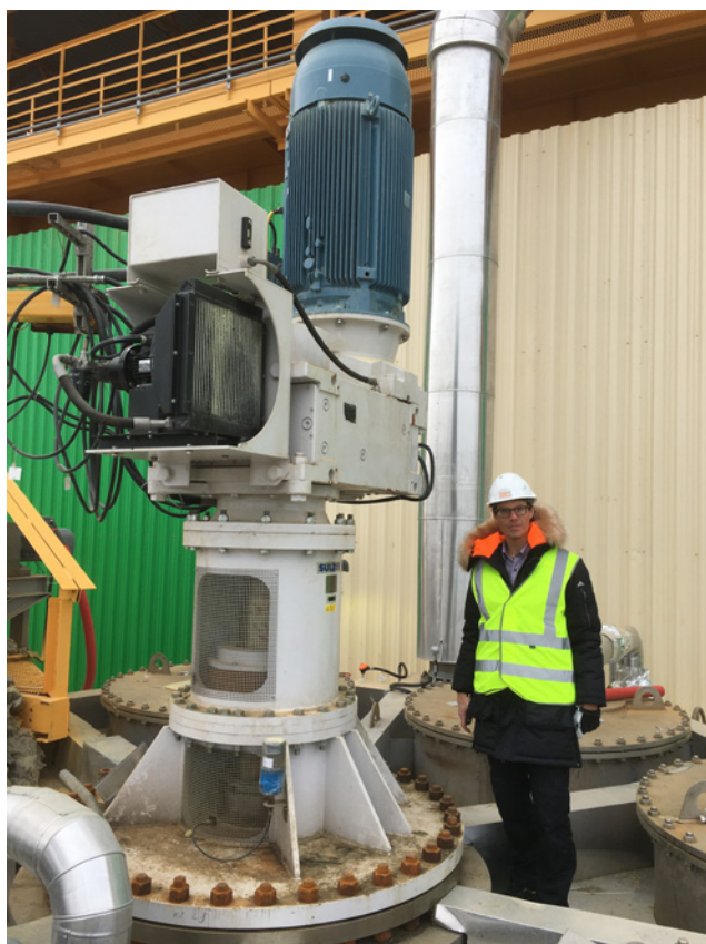
Scaba 240FVPT-Sff agitator operates smoothly at the PhosAgro Cherepovets site in Russia.